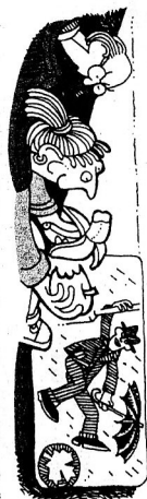
"I ate an apple and a banana in a cinema in Canada."