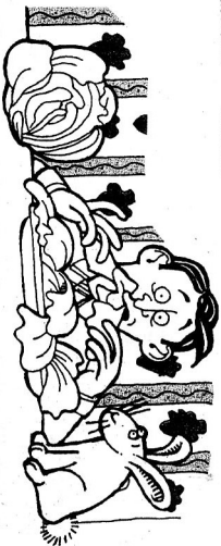
"Alex's lettuces tasted like cabbages."