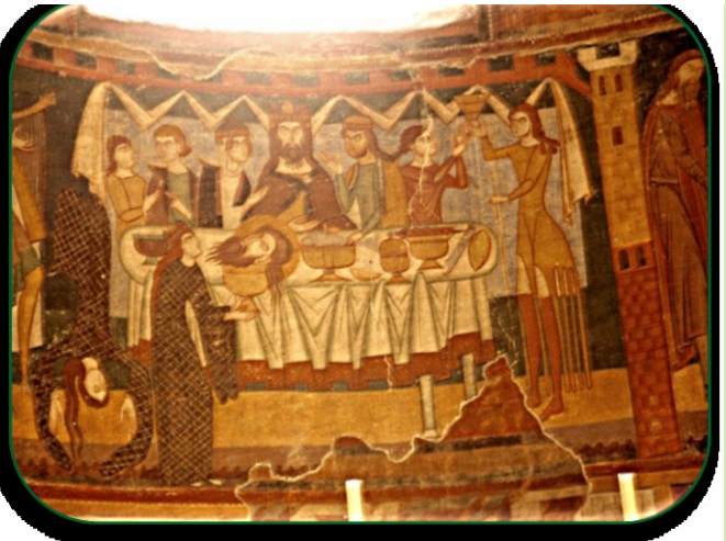
Frankish Empire, 780-900, reign of Charlemange & nis heirs