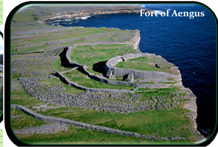
Fort of Aengus