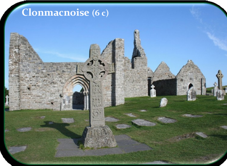
Clonmacnoise (6 c)