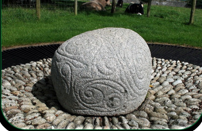
Castlestrange stone (granite boulder decorated with flowing spirals, 500BC)