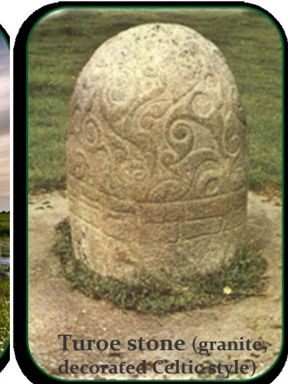
Turoe stone (granite, decorated Celtic style)