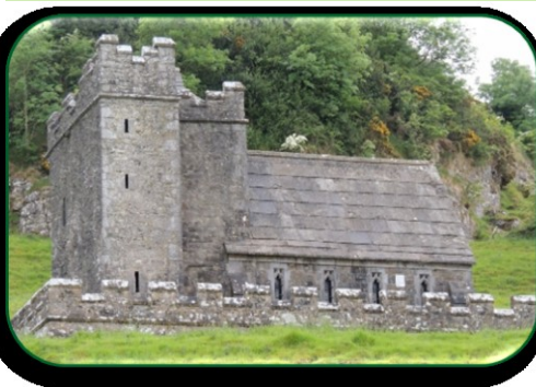
Monasterboice (5 c)