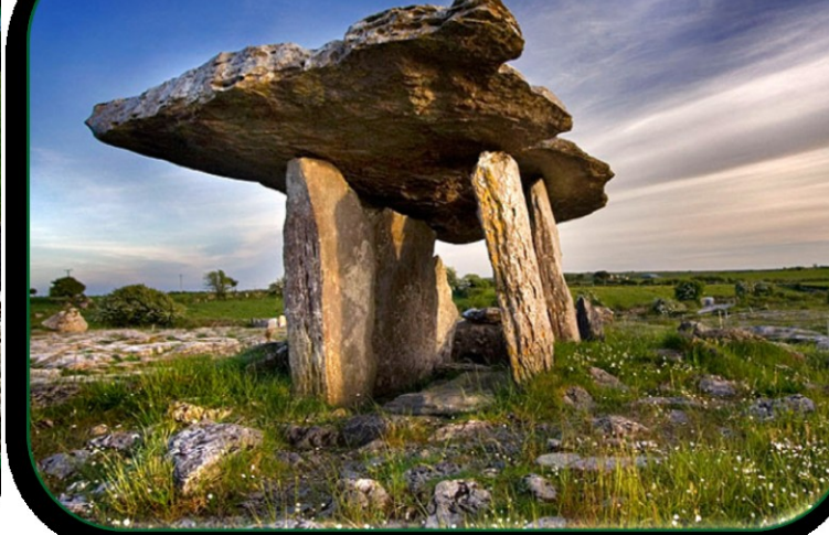
Poulnabrone dolmen (portal tomb)