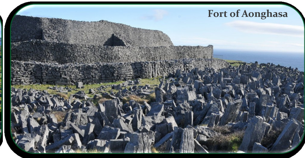
Fort of Aonghasa