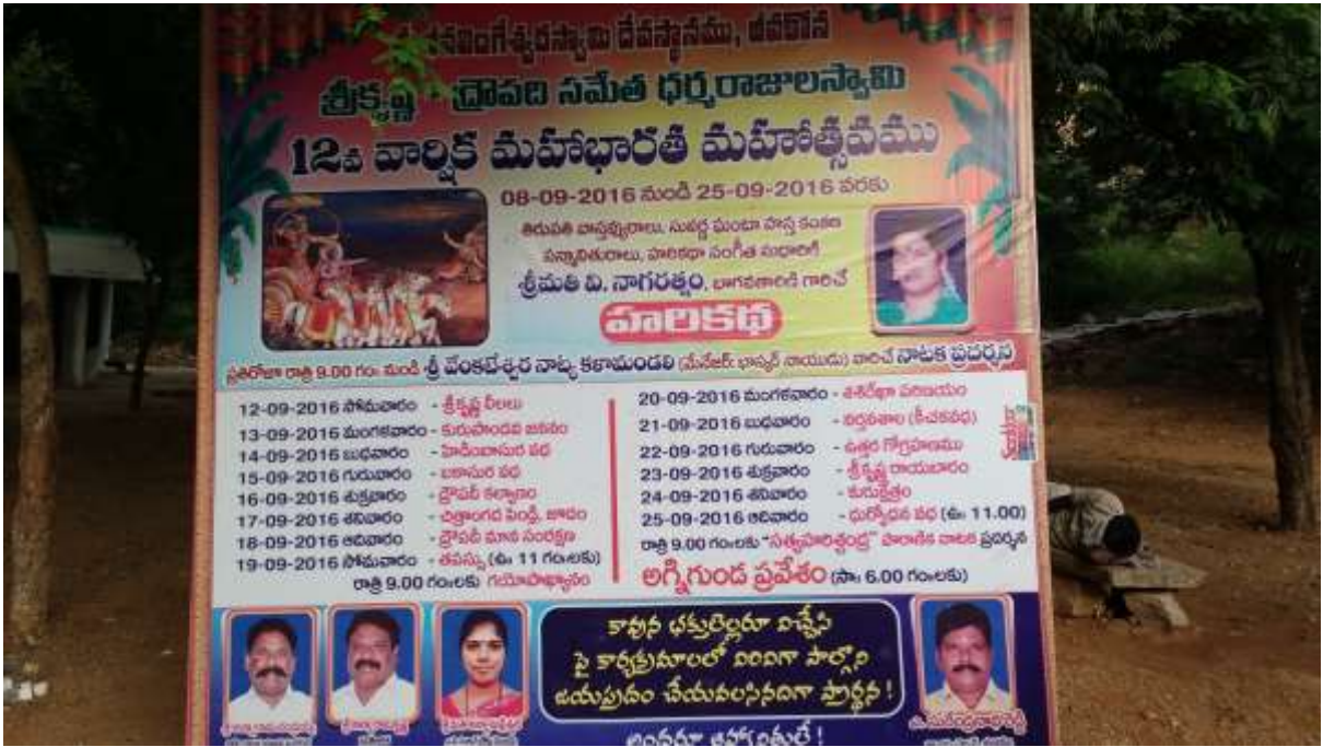
Figure 1: A printed flex board to publicise the festival which was erected in Jeevakona, Tirupati. Sept 10, 2016. List of the performances, name of the theatrical troop and schedule of the performance at the centre; photos of trustees and an invitation note in local language at the bottom; at the top right, famous Harikatha performer V. Nagarathnam; and at the top, in bold letters, the name of the temple that host the festival.

elected, local percussion players of dappu<sup>iii</sup> are directed to announce the festival to the public. After the ceremonial announcement, the trustees approach the public to collect donations. On the next auspicious day, they fix the budget, choose the performing troops, and meet the local decorators. Publicity for the festival includes distributing pamphlets and erecting printed flex boards. Before the festival begins, the trustees make sure that the temple premises and performance spaces are cleaned. Later, the performance space is decorated with locally available and symbolically charged materials, such as turmeric, vermilion, and leaves of coconut and mango. The space behind the acting areas is accommodated for performers to stay during the festival. This space also functions as backstage room for veedhi natakamu performance. The data gathered in 2013 suggests that the trustees of Vendugampalli temple spent 2,12,110 rupees to celebrate the festival; they paid 55,000 rupees to the veedhi natakamu troop for performing 10 days.