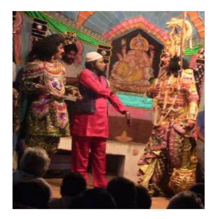
Figure 3: A scene from 'The Disrobing of Draupadi' in Jeevakona, Tirupati. September 18, 2016. Here, Dhusyasana (extreme left) and Duryodhana (extreme right) and buffoon (in the centre, who is wearing South Indian Muslim dress) are performing a scene, where Duryodhana orders Dhusyasana to bring Draupadi. In this scene, buffoon, which is not related to Mahabharata text, warns Duryodhana not to disrespect a woman.

Buffoon even passes his comments on spectatorship. It is intended to appear in the opening play, boring scenes and late at night. Thus, using his improvisation skills, the actor portraying buffoon collaborates to create a space for active spectators and unique performance in veedhi natakamu. In the case of enacting buffoon, actor's collaboration, which leads to development in performance in veedhi natakamu, totally depends on his improvisational skills. According to Barba, actor's dramaturgy is defined as work of the actors in the progress of performance (Barba, 2010, p.23). Just like Barba's reflection on actor's dramaturgy, the actor who portrays buffoon uses his improvisational skills in the progress of veedhi natakamu performances.