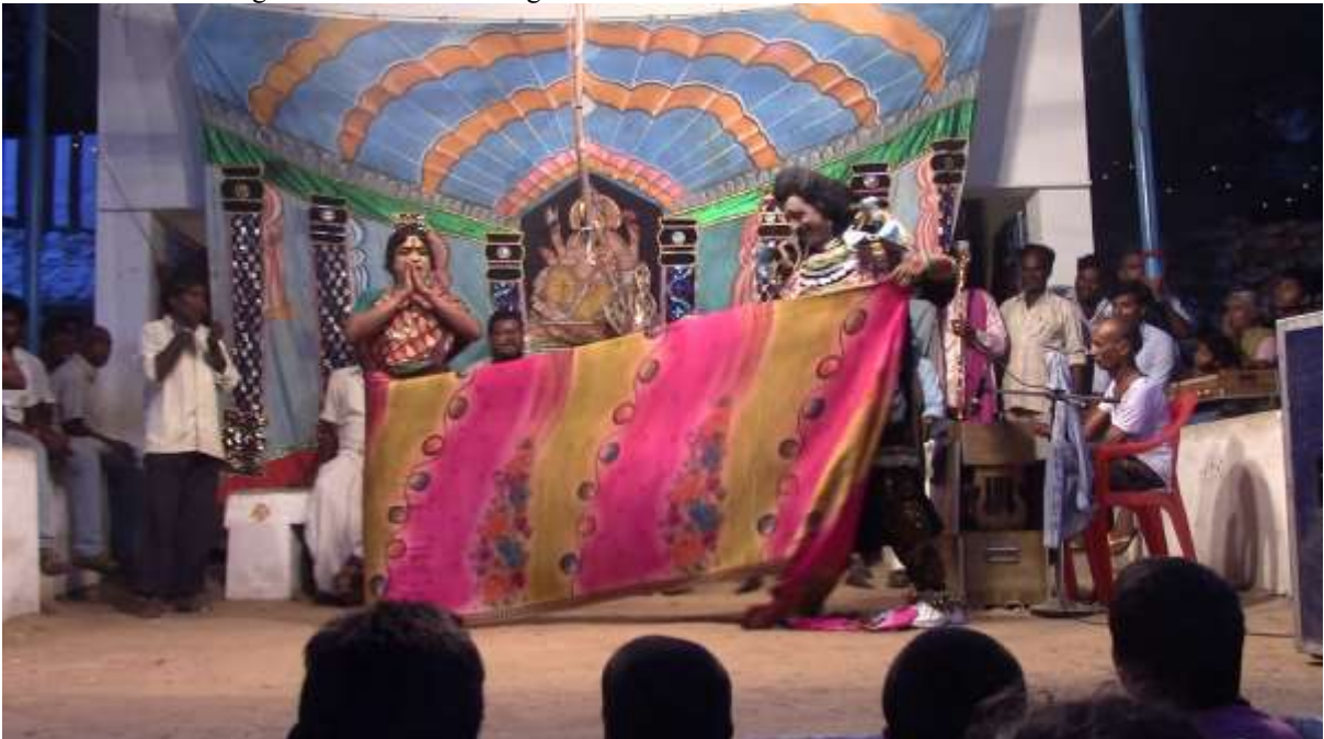
Figure 2: A scene 'The Disrobing of Draupadi' performing on a permanent stage in Jeevakona, Tirupati. September 18, 2016. Trustees and spectators are watching performance standing at up left stage and sitting at upstage.

Countable interruptions are observed during the theatrical performances. Trustees stop the performance any time to announce the next day event. Each day, they announce the names of donors of the events and festival. Approximately, they are visible on the stage thrice during the performance.