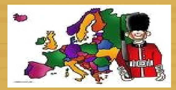
the United Kingdom, the United States of America

Before mountain groups, rivers, island groups, seas, deserts: