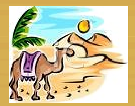
the Sahara Desert