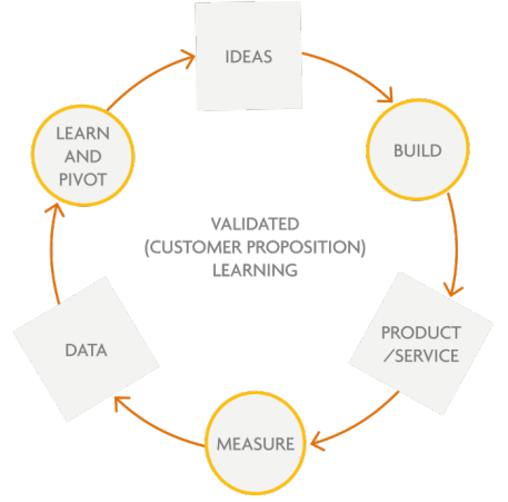
Figure 1. Lean startup approach [13, 14, 15]