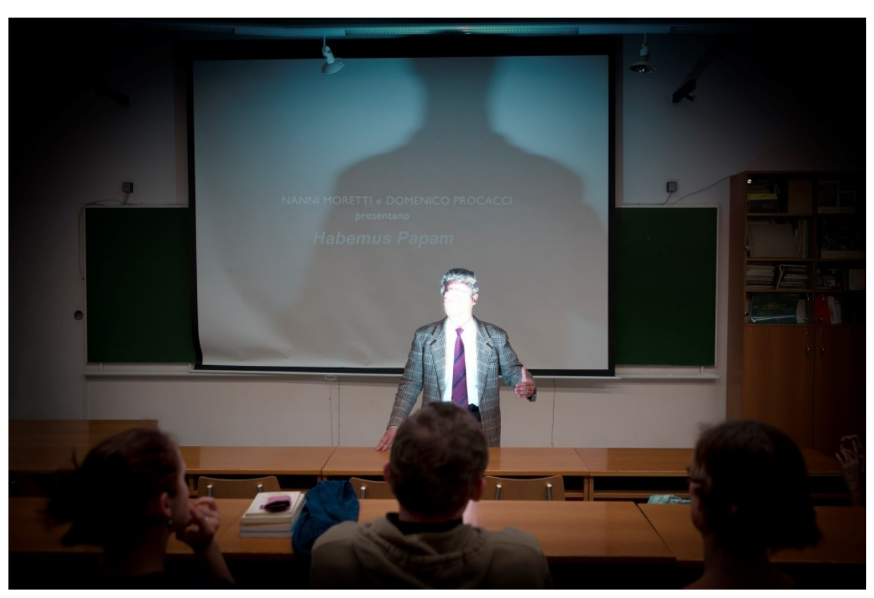
Figure title 1