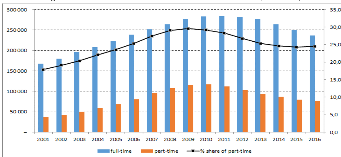
Figure no. 2: Total number of students at universities in Czechia (2001 - 2016)

Source: Web portal MŠMT [online] [vis. September 10, 2017]. Available from http://dsia.uiv.cz/vystupy/vu_vs.html ; own calculations