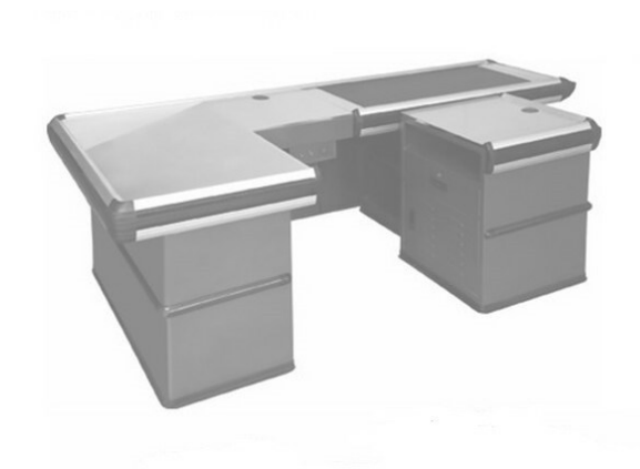
B – Express counter