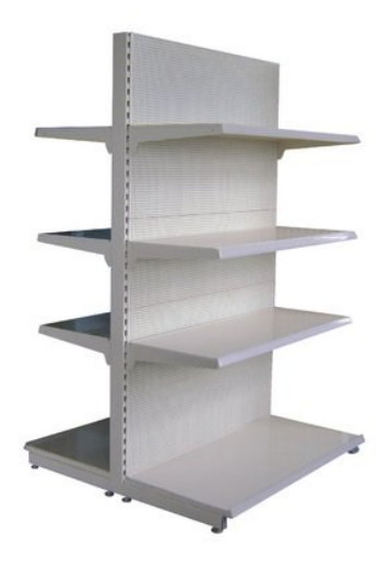
E – Small Rack