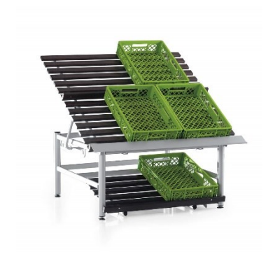
F – Extended Rack