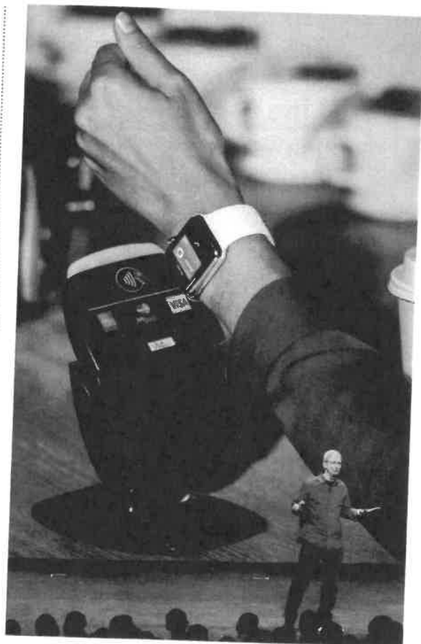
Apple CEO Tim Cook demos Apple Watch and Apple Pay

Why was Apple so successful? Why did Microsoft's once superior market valuation evaporate? Why did Apple's competitors such as Sony, Dell, Hewlett-Packard (HP), Nokia, and BlackBerry struggle or go out of business? The short answer is: Apple had a good strategy. But this begs the question: What is a good strategy?