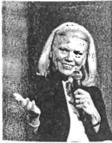
Virginia Rometty, CEO of IBM

At its core, IBM is a solutions company. It solves data-based problems for its business clients, but the technology and problems both change over time. As an example, IBM helped kick-start the PC revolution in 1981 by setting an open standard in the computer industry with the introduction of the IBM PC running on an Intel 8088 chip and a